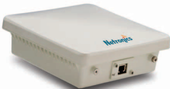
SU-MPL outdoor unit

The SU-MPL, designed for fast installation and configuration, includes complete mounting bracket, visual antenna alignment navigation and intuitive web-based user interface.